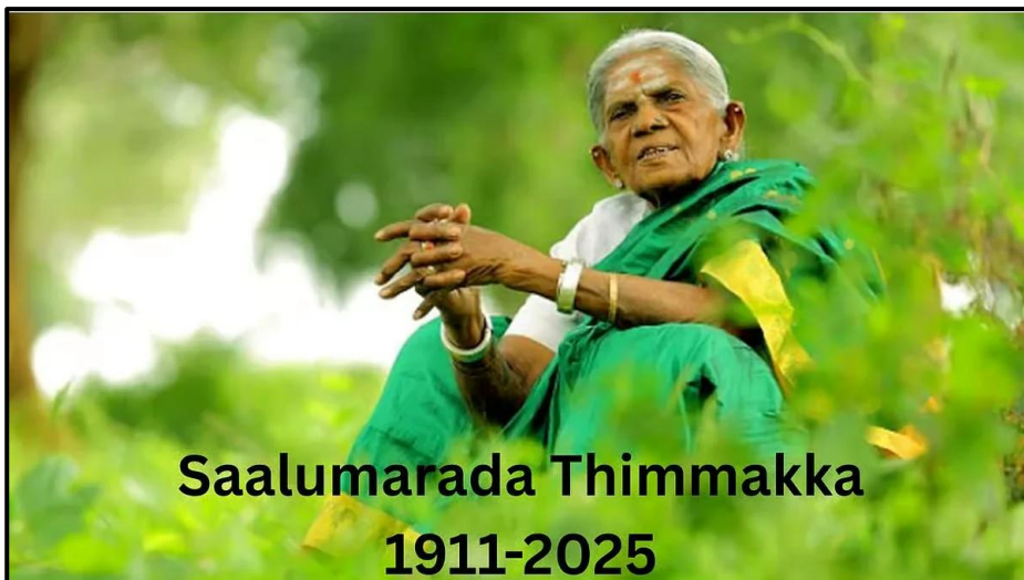
Saalumarada Thimmakka 1911-2025